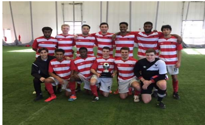
2016 Carleton Tournament Champions: Varsity Ravens