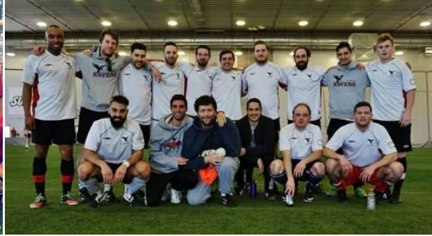
The Alumni Prodigies