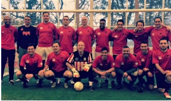
The Alumni Legends 'Old Boys'